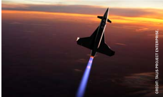
Talis Enterprise's BlackSky hopes to offer cheaper flights than its competitors.

This Swiss-German company hopes to begin testing its BlackSky prototype next year. The winged space plane will fly to a maximum altitude of about 46 kilometers (28.5 miles), somewhat lower than XCOR's Lynx vehicle.