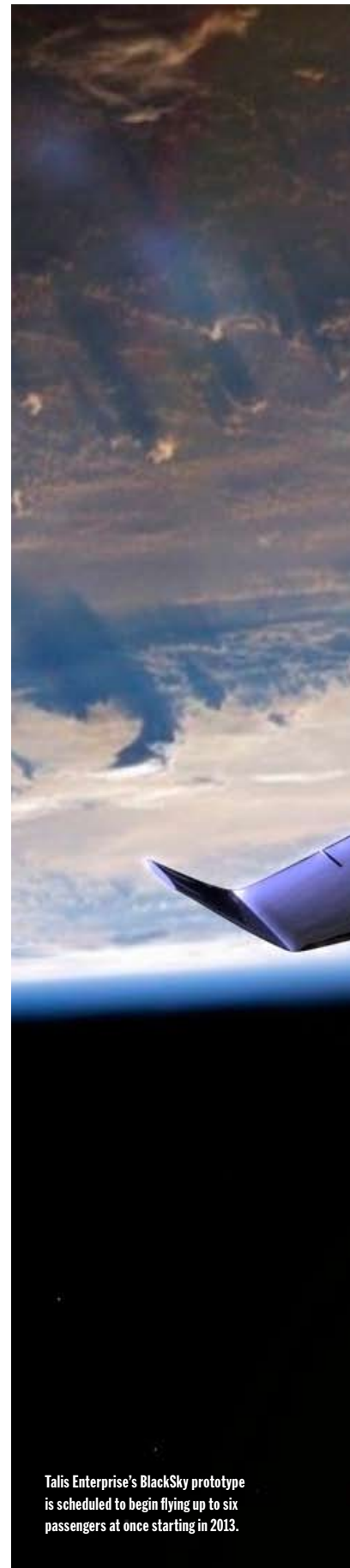
Talis Enterprise’s BlackSky prototype is scheduled to begin flying up to six passengers at once starting in 2013.

Virgin is moving slowly toward commercial operations. WhiteKnightTwo carrier aircraft took off on its first test