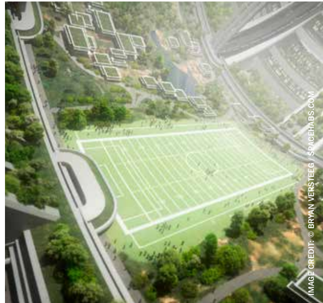
Another interior view from part of the way up an end cap is shown. A soccer game is in progress, complete with spectators.

The paper shows that of all feasible shapes, a cylinder maximizes one-g living area per unit mass if you assume radiation shielding is most of the material needed for the settlement. This is almost certainly the case if you want to have children, as pregnant women and infants are particularly vulnerable to radiation and ample shielding mass is a robust and effective way to limit radiation exposure. Compared to a torus, a cylinder also has the advantage of containing the center, where weightless recreation is possible, and one can insert smaller cylinders in the center—significantly increasing the surface area available, albeit at lower pseudo-gravity levels. Kalpana One uses these interior cylinders for low-g agriculture, storage, manufacture, and recreation.