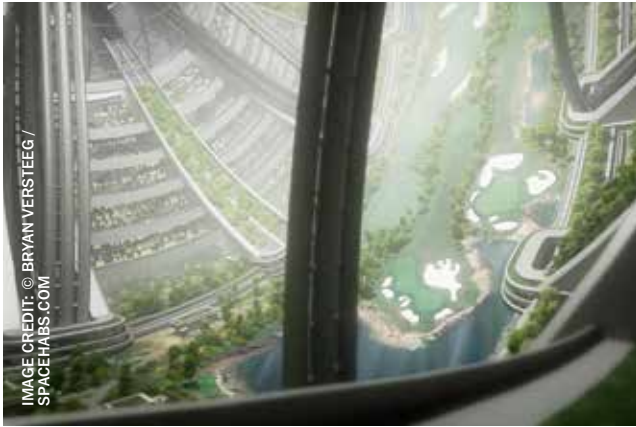
This artist rendition shows the interior, complete with golf course, as viewed from part of the way up an end cap.

Other reasons to build in free space involve taking advantage of weightlessness. There are at least two advantages that really matter: the size of your settlement and recreation. It's easier to build big things in a weightless environment. It's much easier to move big bulky parts around. This, combined with the minimum sizes for a reasonable rotation rate, means free space settlement structures will tend to be bigger than those on the Moon or Mars. Wherever your space settlement is located, going outside will require a spacesuit and expose you to a lot of radiation, so you really want something big to live in—the bigger the better. You're going to spend a lot of time inside. You do not want a place so cramped that you will not enjoy living there.