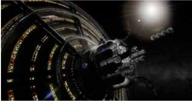
Diameter 1/3 mile — Population 3,000.