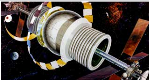
Diameter 1/3 mile — Population 10,000.