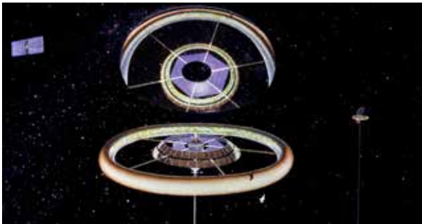
Diameter 1 mile — Population 10,000.