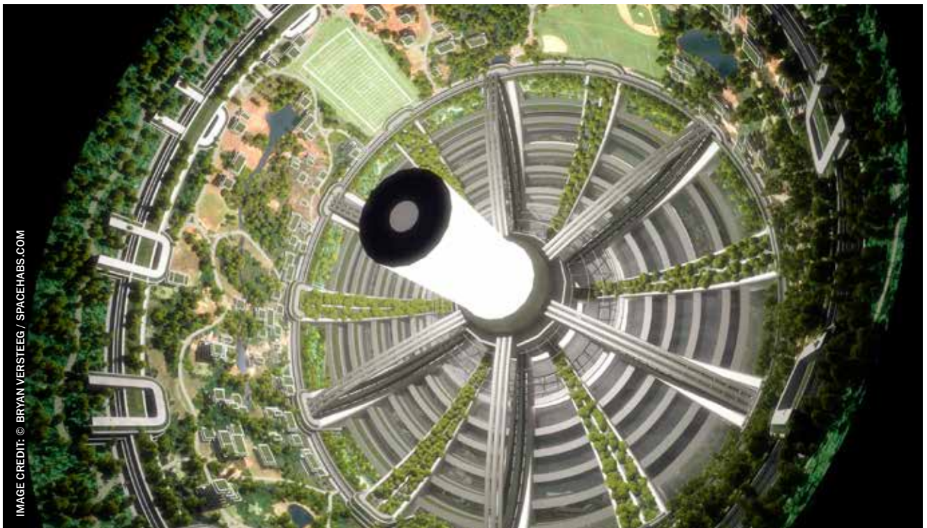
Here is an interior cutaway of Kalpana One. One end cap has been cut away to give a view of the other end cap and most of the one-g interior living space, including substantial sports facilities. The space inside the bright interior cylinder can be used for storage, agriculture, partial-g industry, and low-g recreation and performance arts.

There are other reasons to build space settlements in free space rather than on a planet or moon. Communication, resupply, and trade are all easier. As an added bonus, solar energy is much more abundant—there is no night! The only essential that isn't easier is access to bulk materials, but by co-orbiting with a convenient near-Earth asteroid, the materials problem can be elegantly resolved. There are around 20,000 near-Earth asteroids big enough to supply materials for at least one settlement the size of Kalpana One. Another option is to bring asteroid material to cislunar space. Deciding whether to build Kalpana One from asteroid or lunar material, or a combination of both, will require extensive trade-off studies, and will also depend on the extent to which these resources are developed for other purposes.