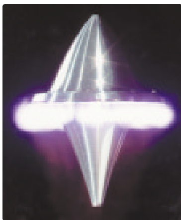
A model of a lightcraft, illuminated from below by a laser beam.

In an era of rapid technological innovation, it is amazing how some technologies have almost stood still during that time. The latter half of the 20th century saw incredible improvements in computing, communications, and biotechnology, among other fields. This has enabled everything from the mapping of the human genome to the development of the Internet.