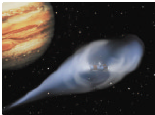
Artist's impression of a mini-magnetosphere deployed around a spacecraft.

Solar sail propulsion is one advanced technology whose time may have finally come. The concept of harnessing sunlight to propel a spacecraft dates