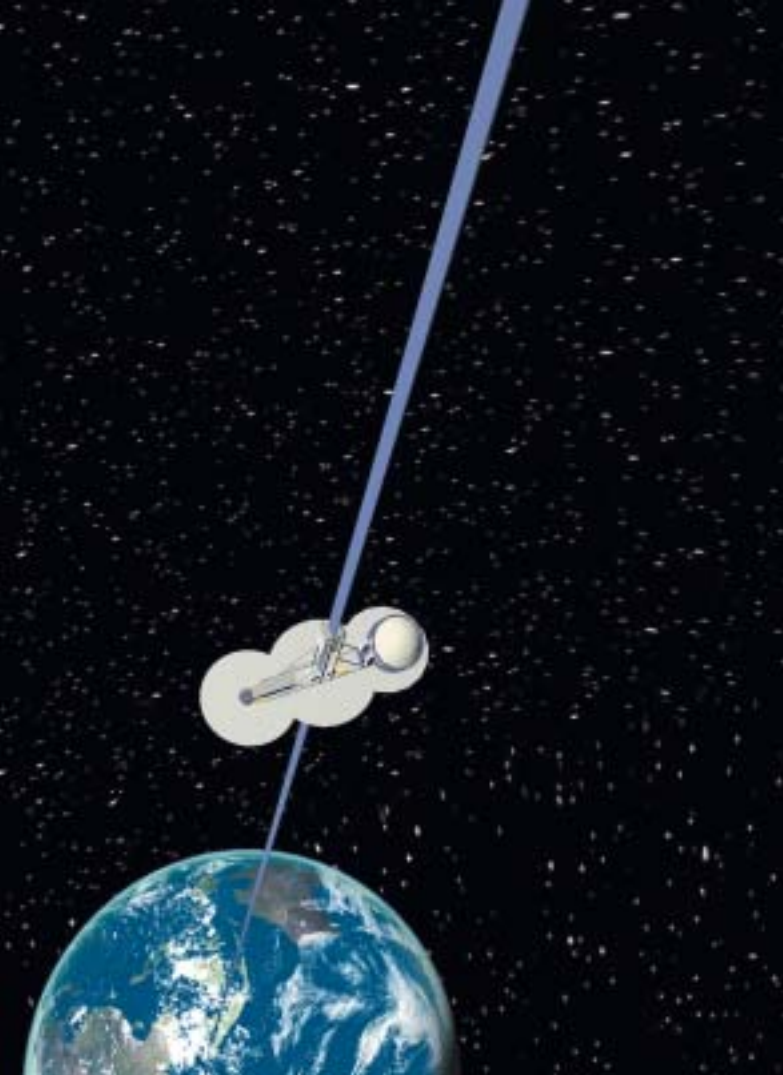
The space elevator climber is shown ascending the ribbon to high-Earth orbit. The circular structures are photo arrays, the drive section is seen as two treads sandwiching the ribbon, and the command and control components are the small box structures. The payload, a satellite, is shown on the lower half of the climber.