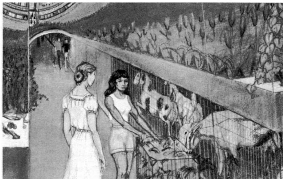
Illustration from Henson paper.