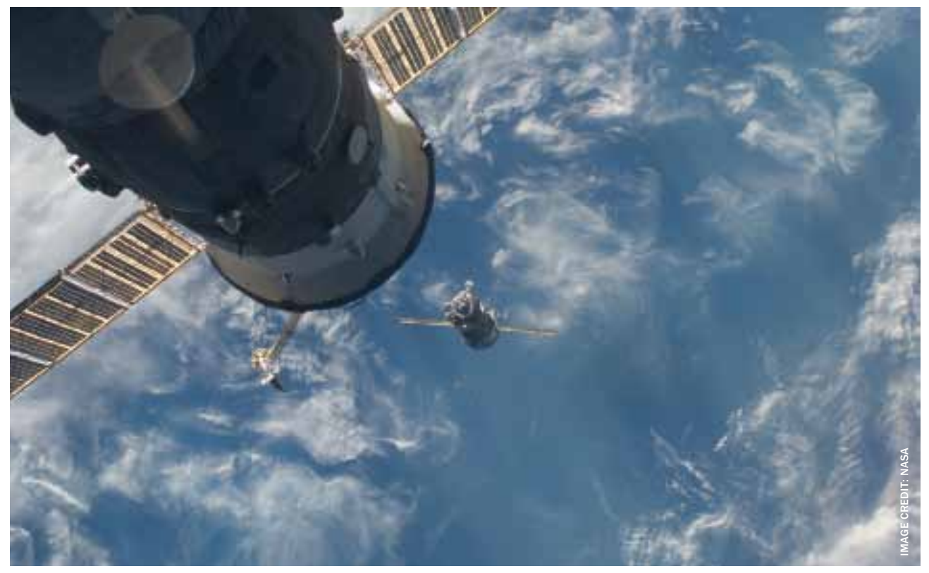
The Soyuz TMA-17 spacecraft approaches the International Space Station, carrying Russian cosmonaut Oleg Kotov, Soyuz commander and Expedition 22 flight engineer; along with NASA astronaut T.J. Creamer and Japan Aerospace Exploration Agency astronaut Soichi Noguchi, both flight engineers. Docking to the Zarya nadir port occurred at 4:48 p.m. (CST) on December 22, 2009. The trio launched aboard the Soyuz TMA-17 spacecraft at 3:52 p.m. on December 20 from the Baikonur Cosmodrome in Kazakhstan. A docked Russian spacecraft is at top left.

optical-quality window for photography, although the crew also takes pictures from the many other windows aboard. A noteworthy longterm project in this area is EarthKAM (Earth Knowledge Acquired by Middle School Students), which allows high school students to use a dedicated, remotely operated camera. The students' target requests are coordinated by college students at the University of California in San Diego, uplinked to a computer controlling the camera, and the resulting images are downlinked to the world wide web. As of 2006, more than 65,000 students in more than 1,000 schools in the U.S. and 12 other countries had used EarthKAM in geography and Earth science projects of their own formulation.