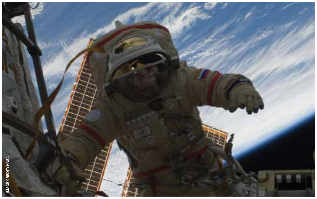
Russian cosmonauts Oleg Kotov and Maxim Suraev (out of frame), both Expedition 22 flight engineers, participate in a session of extravehicular activity (EVA) as maintenance and construction continue on the International Space Station. During the spacewalk, Kotov and Suraev prepared the Mini-Research Module 2 (MRM2), known as Poisk, for future Russian vehicle dockings.

Systems Inc., Space-DRUMS uses beams of sound energy to push materials away from the walls of a container in microgravity. The samples so produced will be ultra-pure and concentrated, and much larger than materials previously produced in space. A single sample might be worth hundreds of thousands of dollars.