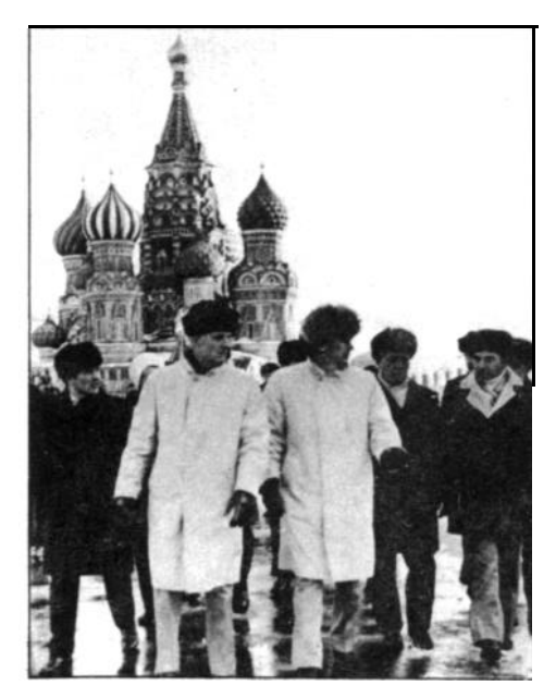
A group of astronauts and cosmonauts stroll through Red Square.

Recently the laboratory of controlled biosynthesis at our institute was living in rhythm with the Moon. For fourteen earth days wheat passed through one "moon" day under the light of powerful xenon '*suns." For the next fourteen days night reigned in the chambers containing the wheat-dark, but significantly less cold than on the Moon. And so on for more than 100 days in a row.