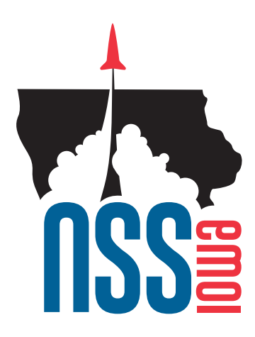
NSS Iowa Chapter